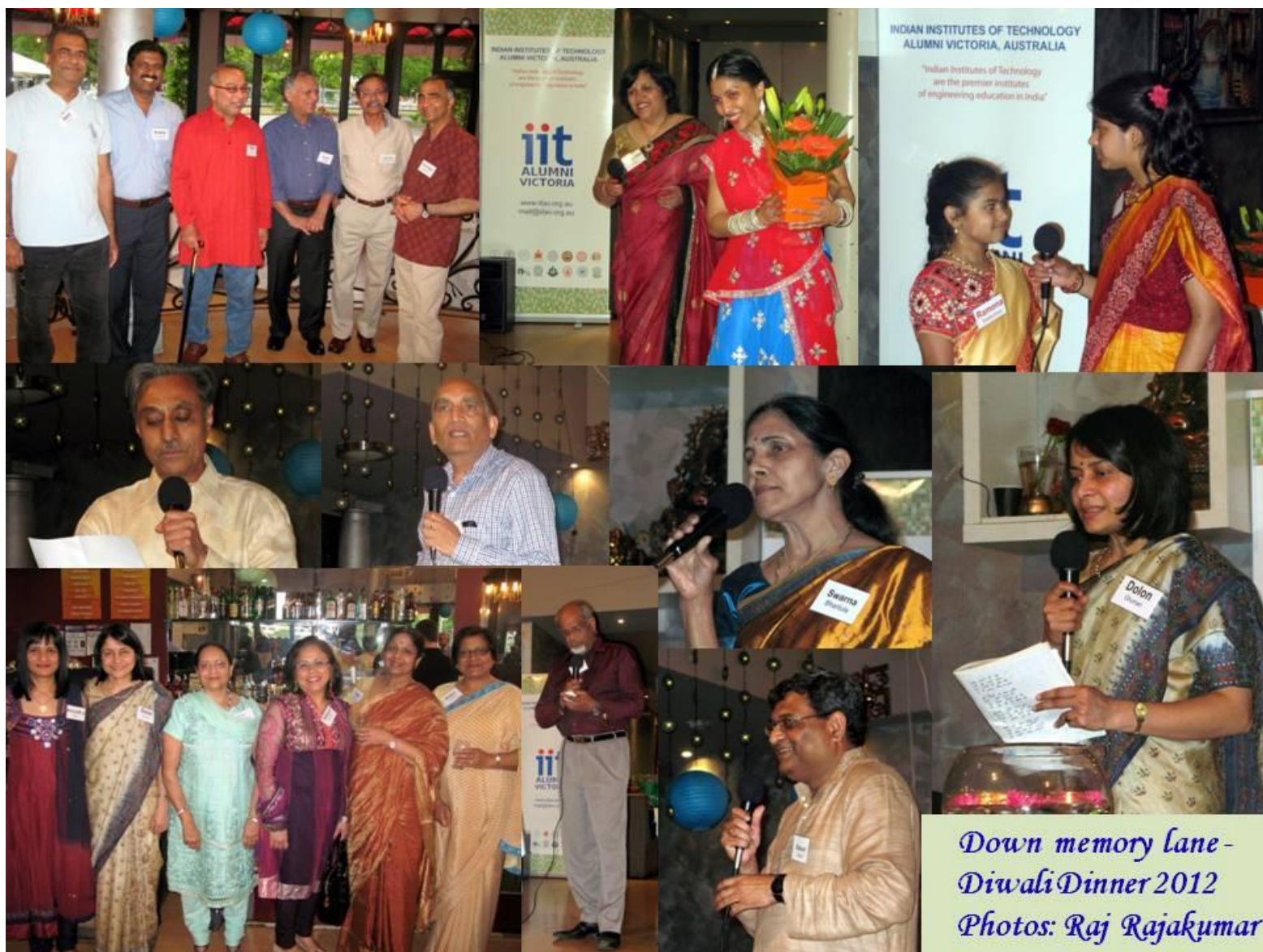
Down memory lane - Diwali Dinner 2012